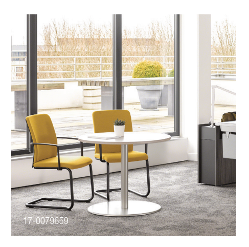
SUPPORT FOR COLLABORATION

TouchDown supports informal meetings from two to six people. Castors and foldaway tables offer the flexibility to move and reorganise the space as needed.