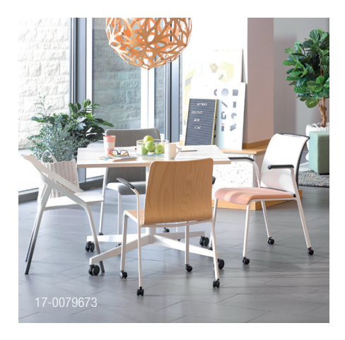
FLEXIBILITY FOR SOCIAL SPACES

TouchDown supports informal meetings from two to six people. Castors and foldaway tables offer the flexibility to move and reorganise the space as needed.