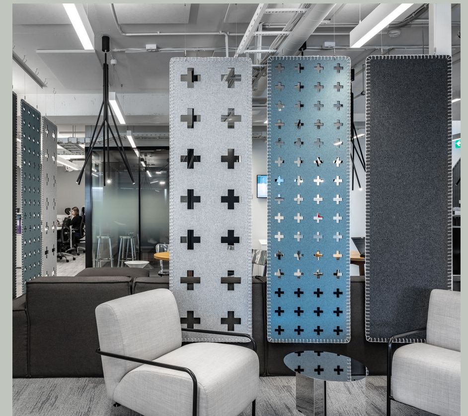
Project on the right: McDonald's HQ, Chicago Architecture & Interior Design: Sterling Bay +Gensler · IA Interior Architects y Studio O+A.