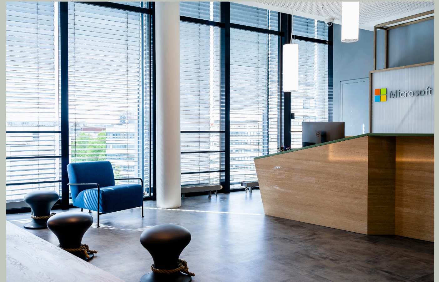
Project: Microsoft Office, Hamburg Interiors: Lepel & Lepel