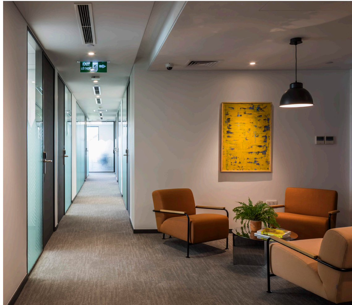
Project: Spaces Belvedere, Vietnam Interior design: Interior Architect_D&P Associates: Supplier_FacilitylinQ