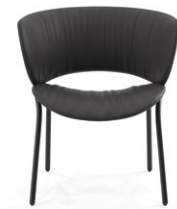
Funda armchair 4 metal legs