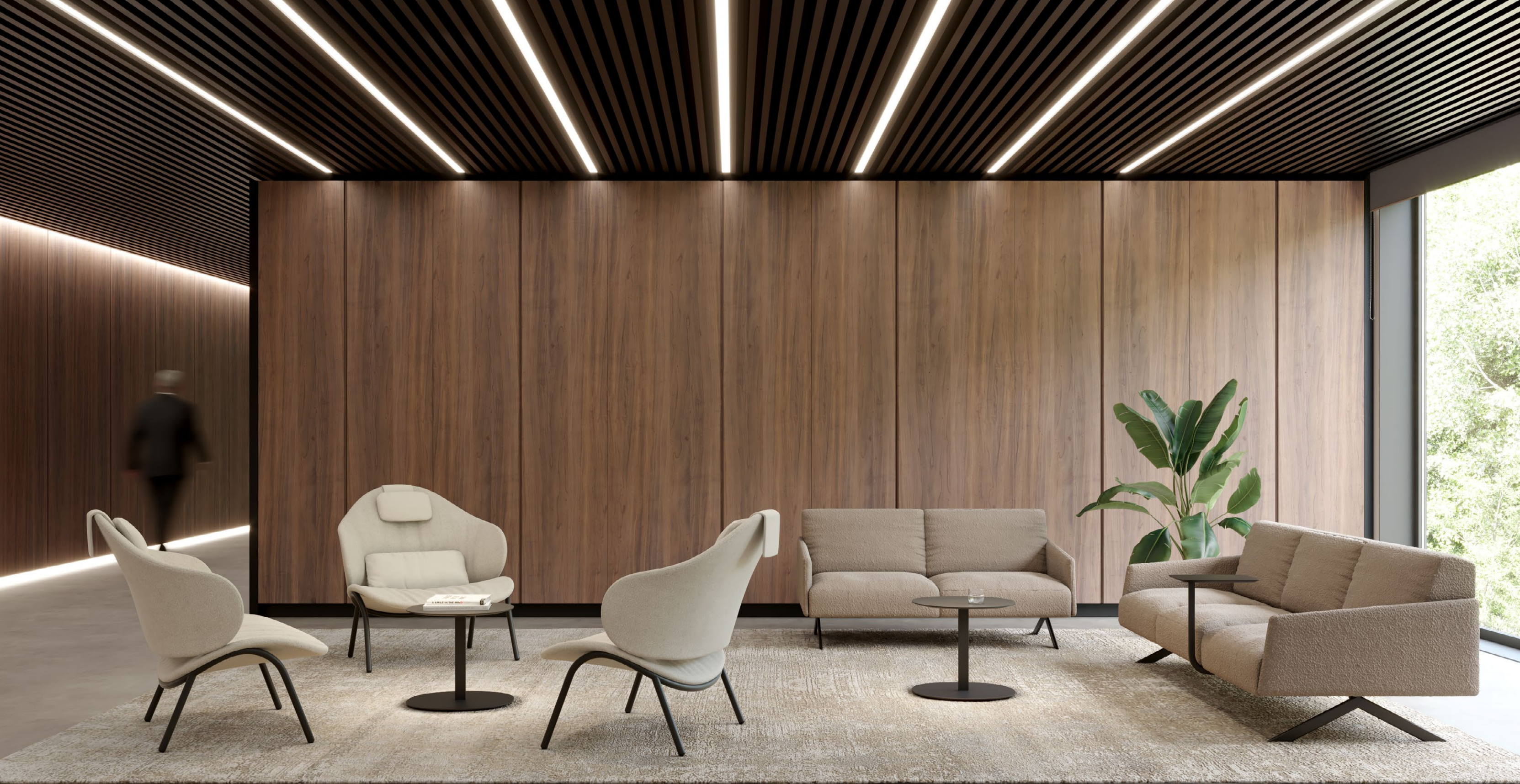
On the left page, Funda Bold in different finishes with cushion and ottoman. On this page, Two Funda Bold with cushion and headrest.