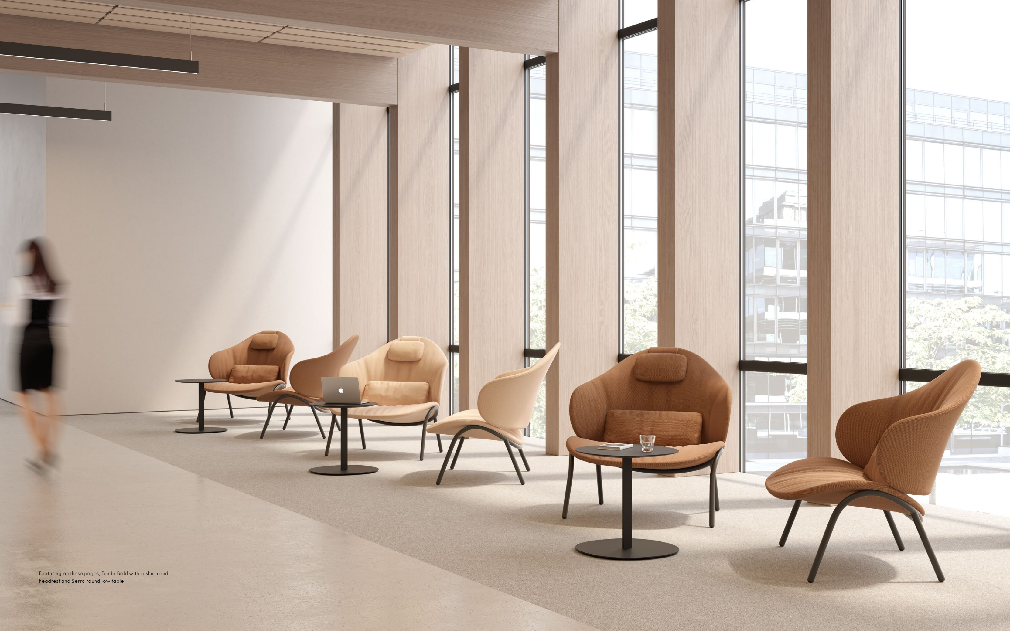
Featuring on these pages, Funda Bold with cushion and headrest and Serra round low table