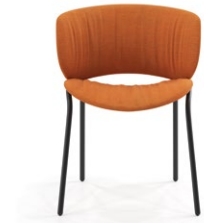
Funda chair 4 metal legs