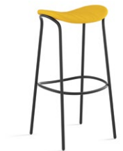
Funda bar stool metal legs