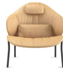
Funda Bold 4 metal legs