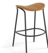
Funda counter stool metal legs