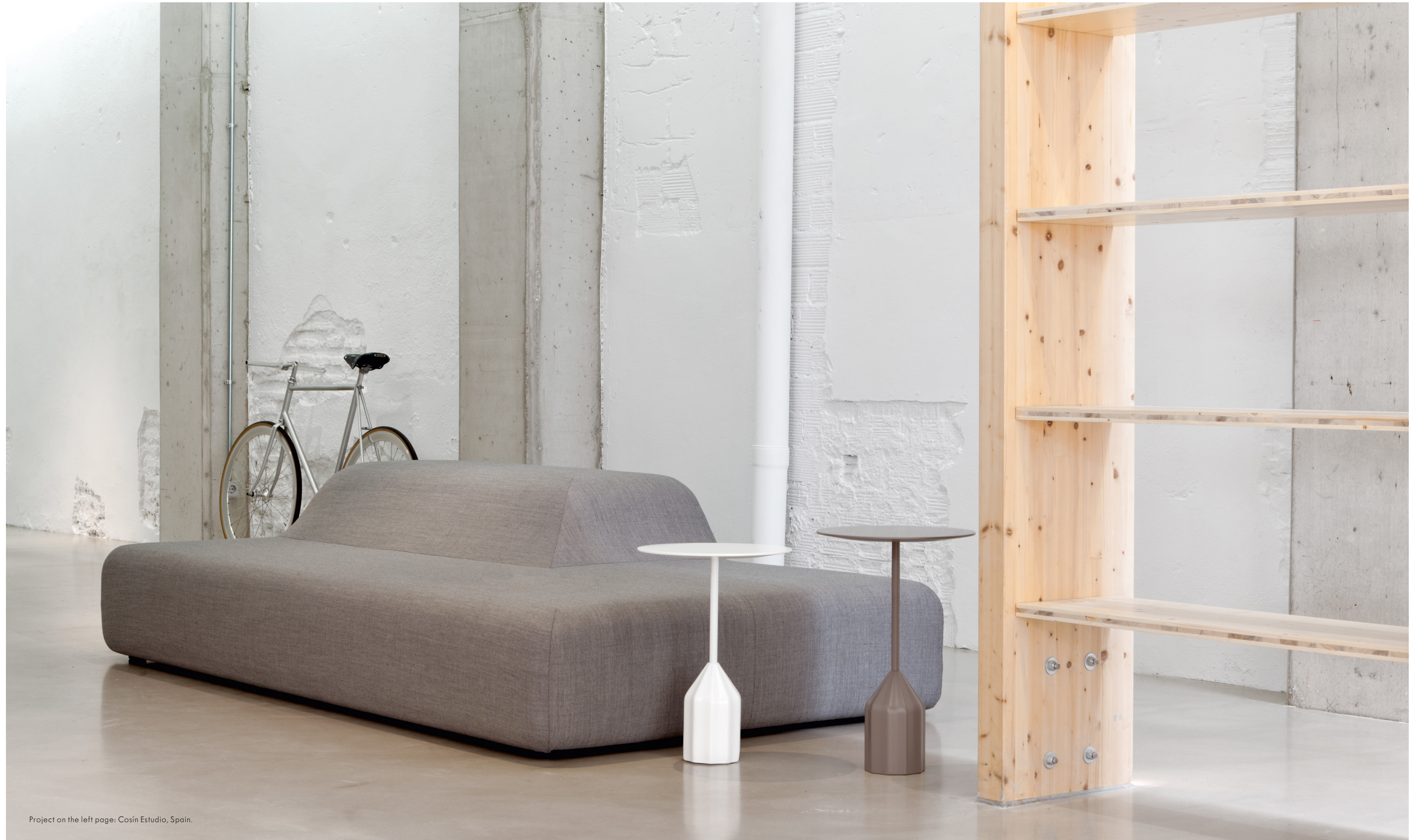
Project on the left page: Cosín Estudio, Spain.