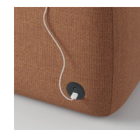
1. USB port, upholstery

Project on the left page: Cosín Estudio, Spain.