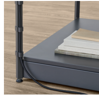
Cable Management Clip