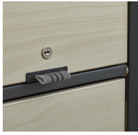
Fabric Door Handle + Lock