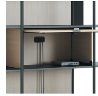
Media Tower Cable Management