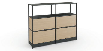
End of Run