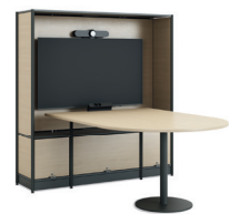
4-High Media Tower with Table (Internal Mount)