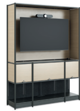
5-High Media Tower (Internal Mount)