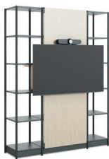
5-High Media Tower (External Mount)