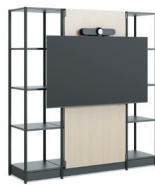
4-High Media Tower (External Mount)