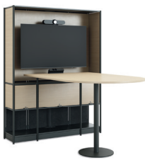
5-High Media Tower with Table (Internal Mount)