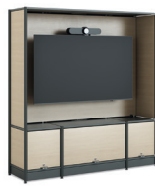
4-High Media Tower (Internal Mount)