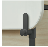
Mobile Board Clip