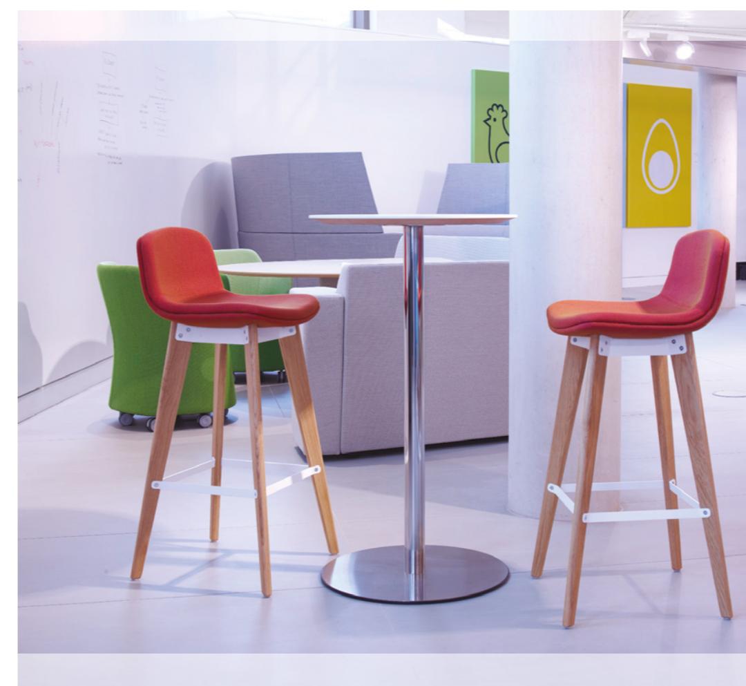
Stools (wood base/upholstered).