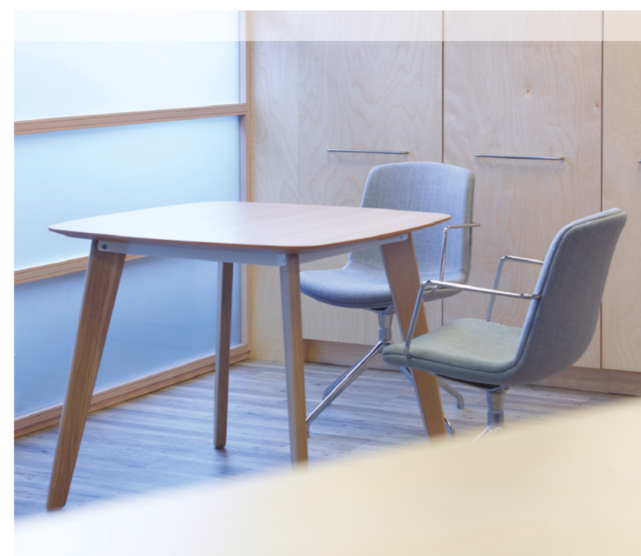
Chairs (trestle swivel base/wire arm) with soft square table.