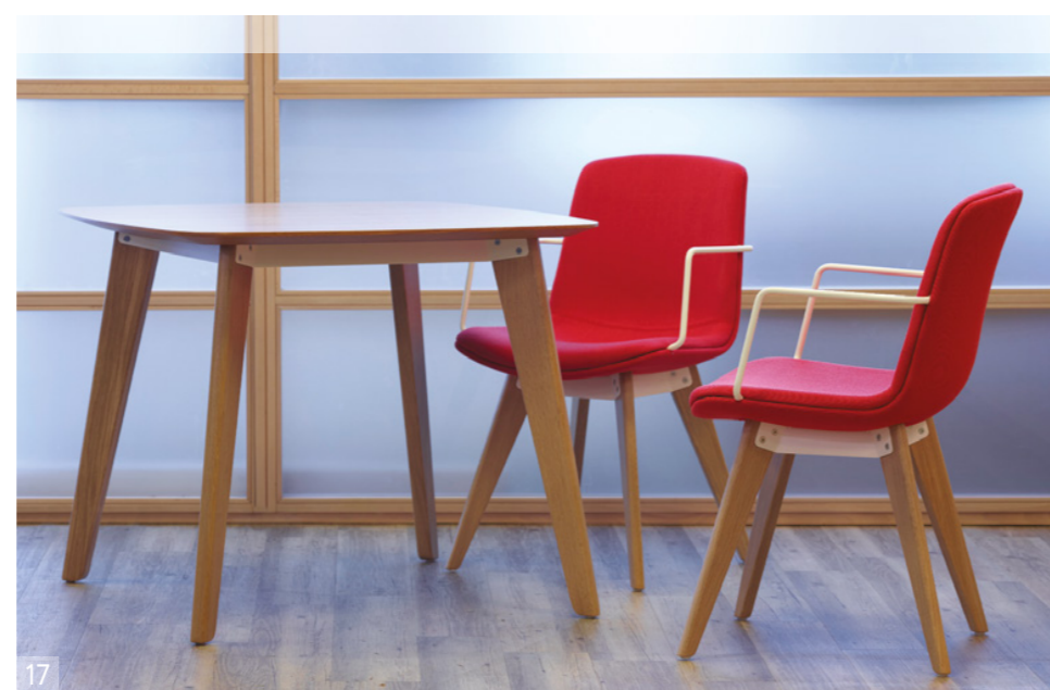
08. wood base – upholstered arm / non arm 09. wood base – non arm 10. wood base – upholstered arm 11. stools – upholstered 12. trestle swivel base – wire arm 13. trestle swivel base – wire arm 14. wood base – non arm / upholstered arm 15. trestle swivel base – wire arm with soft square table 16. stools – wire 17. wood base – wire arm with soft square table 18. stools – upholstered 19. wood base – upholstered arm / non arm