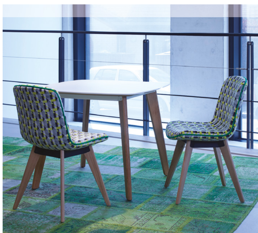
Chairs (wood base/non arm) with soft square table.