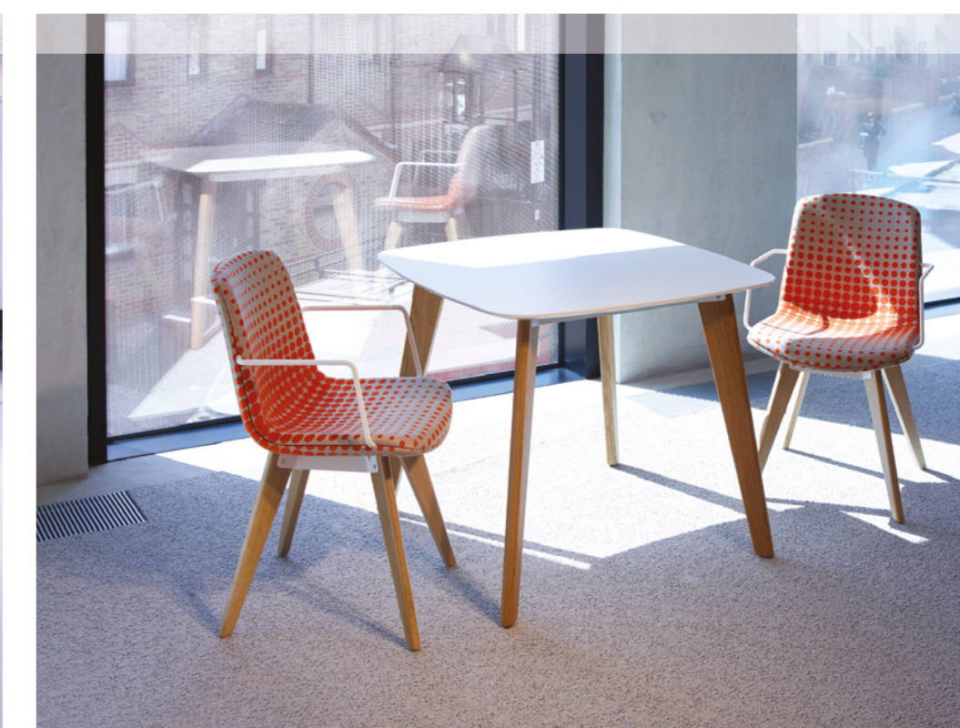
Chairs (wood base/wire arm) with soft square table.