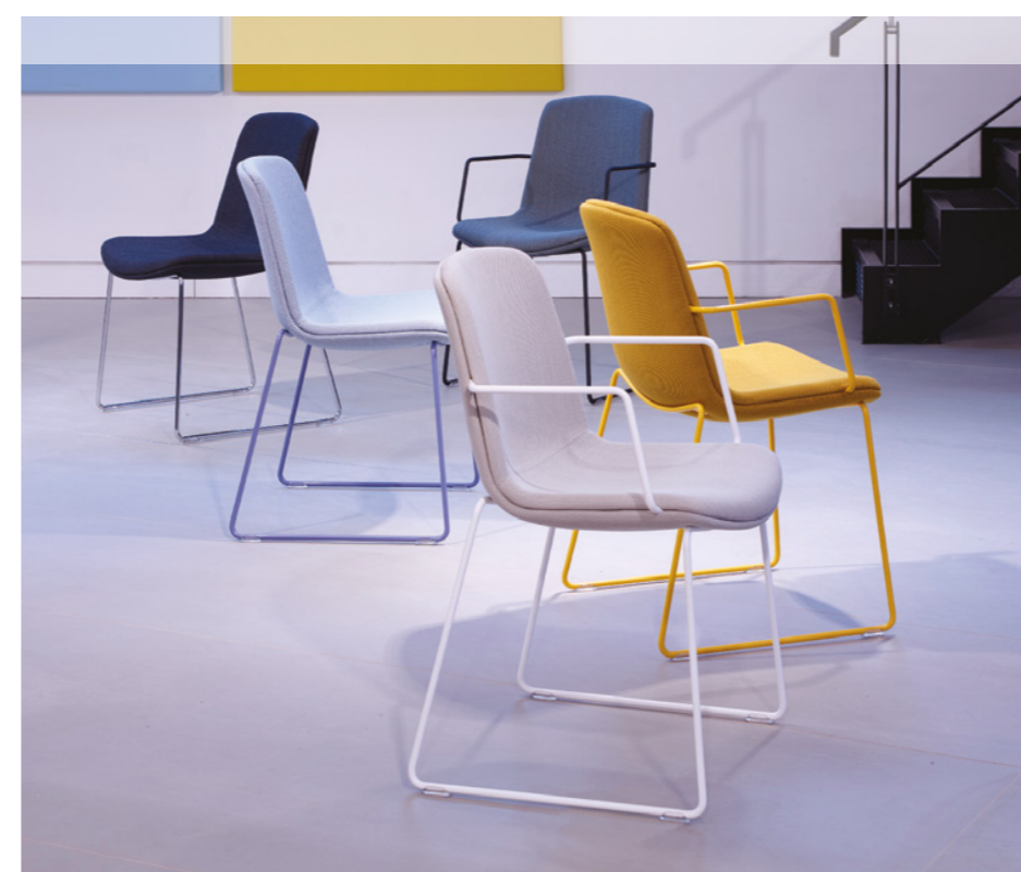
Chairs (wire base/wire arm and non arm).