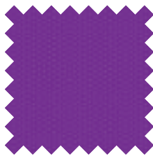
Purple IPC 309