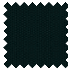
Grey (dark teal) IPC 122