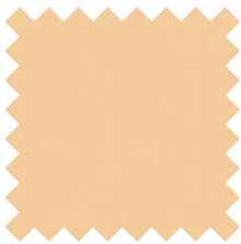
Brown (light beige) IPC 423