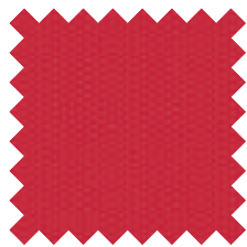
Red (Scarlet) IPC 202