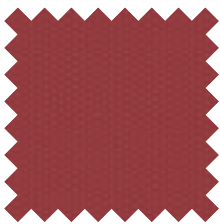
Red (burgundy) IPC 408