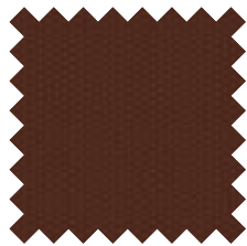
Brown (dark) IPC 401