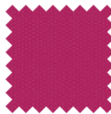
Pink (fuchsia) IPC 210