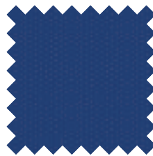
Blue (royal) IPC 302