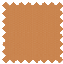
Brown (dark beige) IPC 434