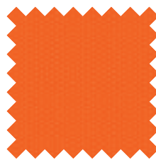
Orange (bright) SBN 508