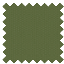
Sage Green IPC 504