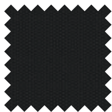
Black IPC 101