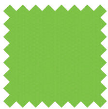
Lime Green IPC 518