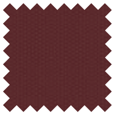
Brown (Walnut) SBN 414