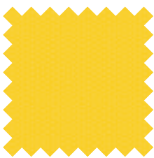
Yellow (bright) IPC 108