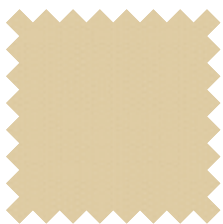
Natural SBN 219