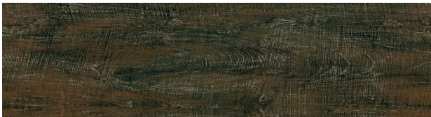
A00411 DARK WALNUT