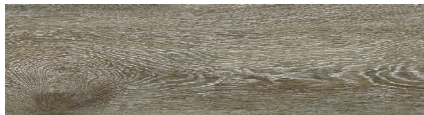
A00405 GREY DUNE