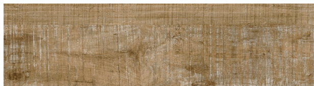
A00403 DISTRESSED HICKORY