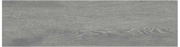
A00417 SILVER DUNE