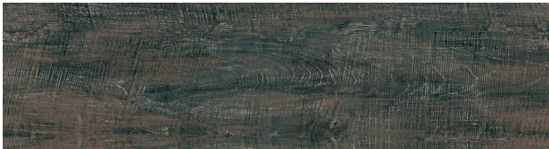
A00410 SILVER WALNUT