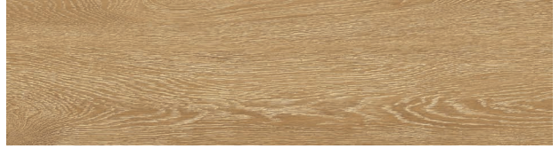
A00415 ANTIQUE OAK