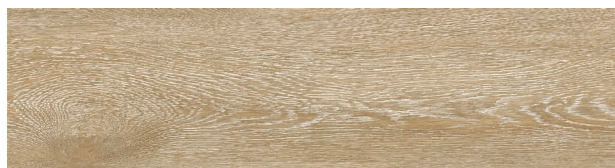
A00406 ANTIQUE LIGHT OAK

All product specifications reflect averages derived from product sample testing, are subject to normal manufacturing and testing tolerances and inherent pattern variances, and may be changed without notice. For more information about these and other important attributes of the product(s) described herein, including recycled content and product warranty information, please see our full LVT product disclaimer @ interface.com.