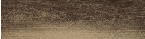
A00409 ASH WALNUT