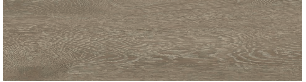
A00416 ANTIQUE DARK OAK