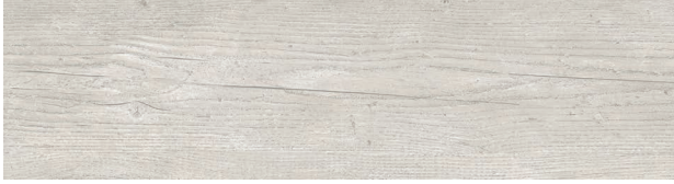
A00407 WHITE WASH