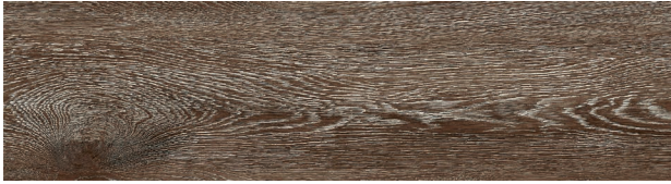
A00408 ANTIQUE GRAY OAK