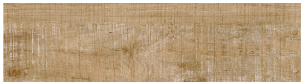
A00402 DISTRESSED CASHEW