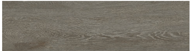
A00418 CHARCOAL DUNE