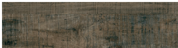
A00404 DISTRESSED BLACK WALNUT