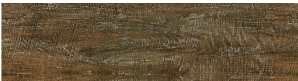
A00412 RECLAIMED HICKORY