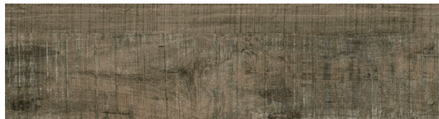
A00401 DISTRESSED WALNUT