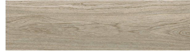
A00207 WASHED WHEAT