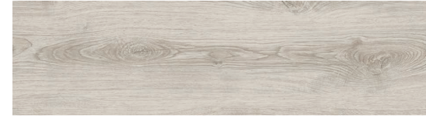
A00208 SAND DUNE